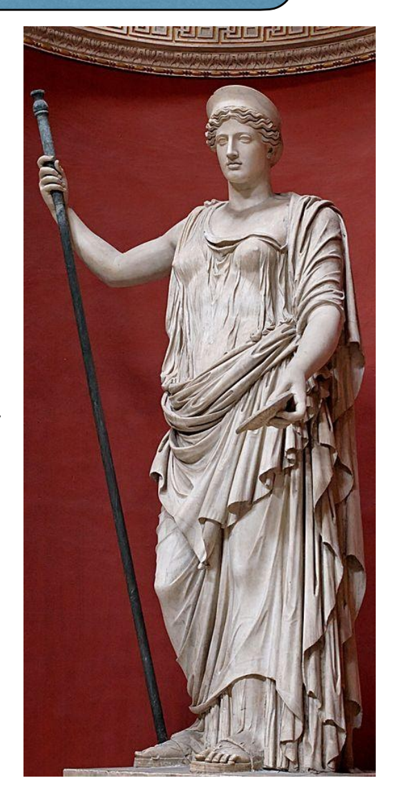
THE GREEK GODDESS HERA. ROMAN COPY, ORIGINAL C. 5TH CENTURY BC

The Heraean Games took place every 4 years and