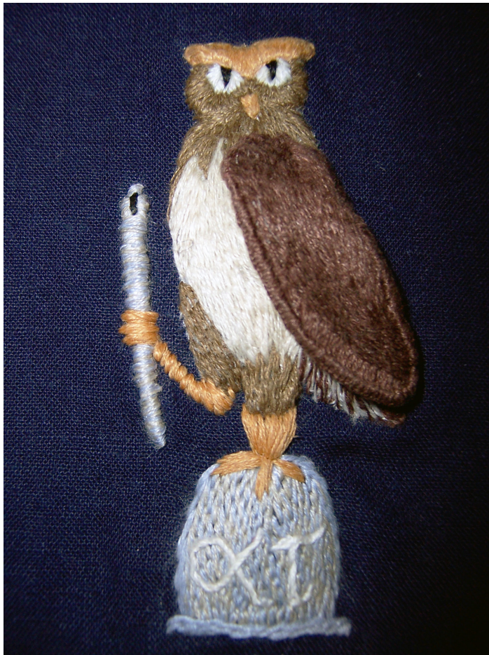
Vienna de la Mer's rendering of the Athena's Thimble badge