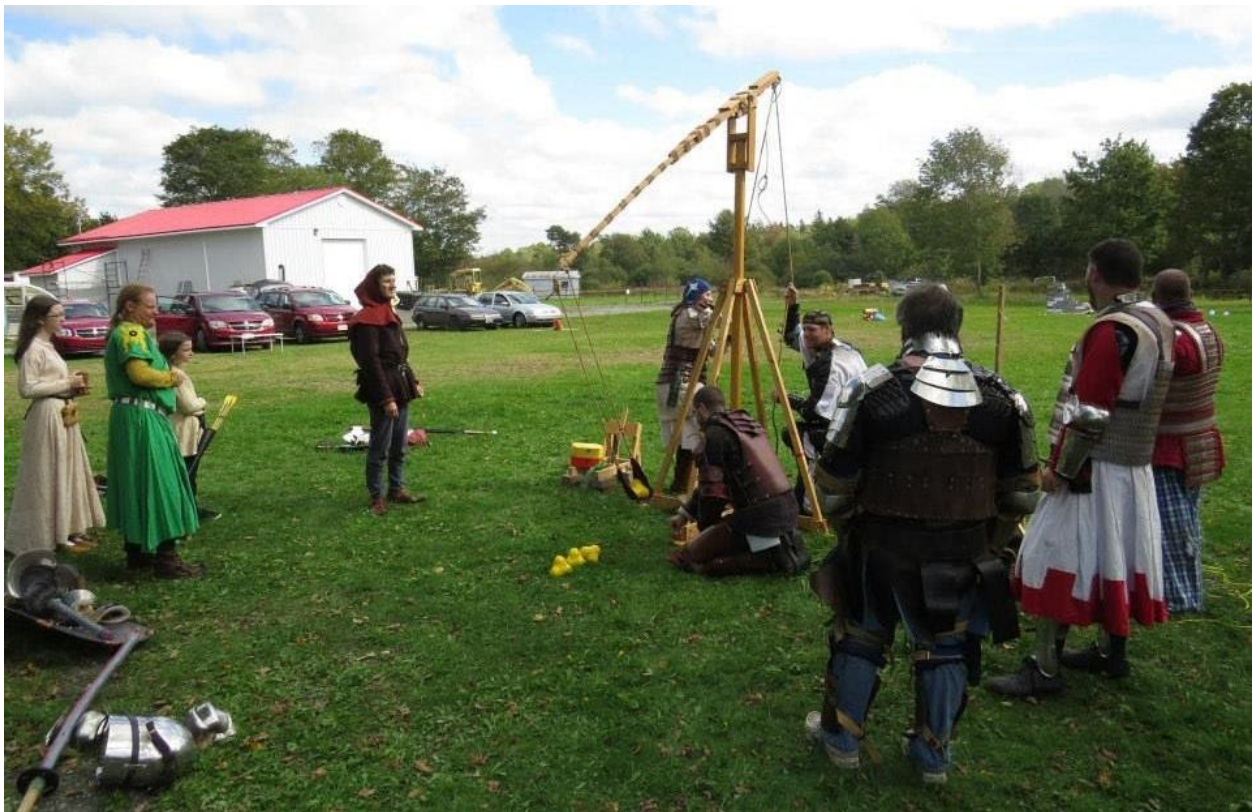
Siege of Castle Theodore, 2014