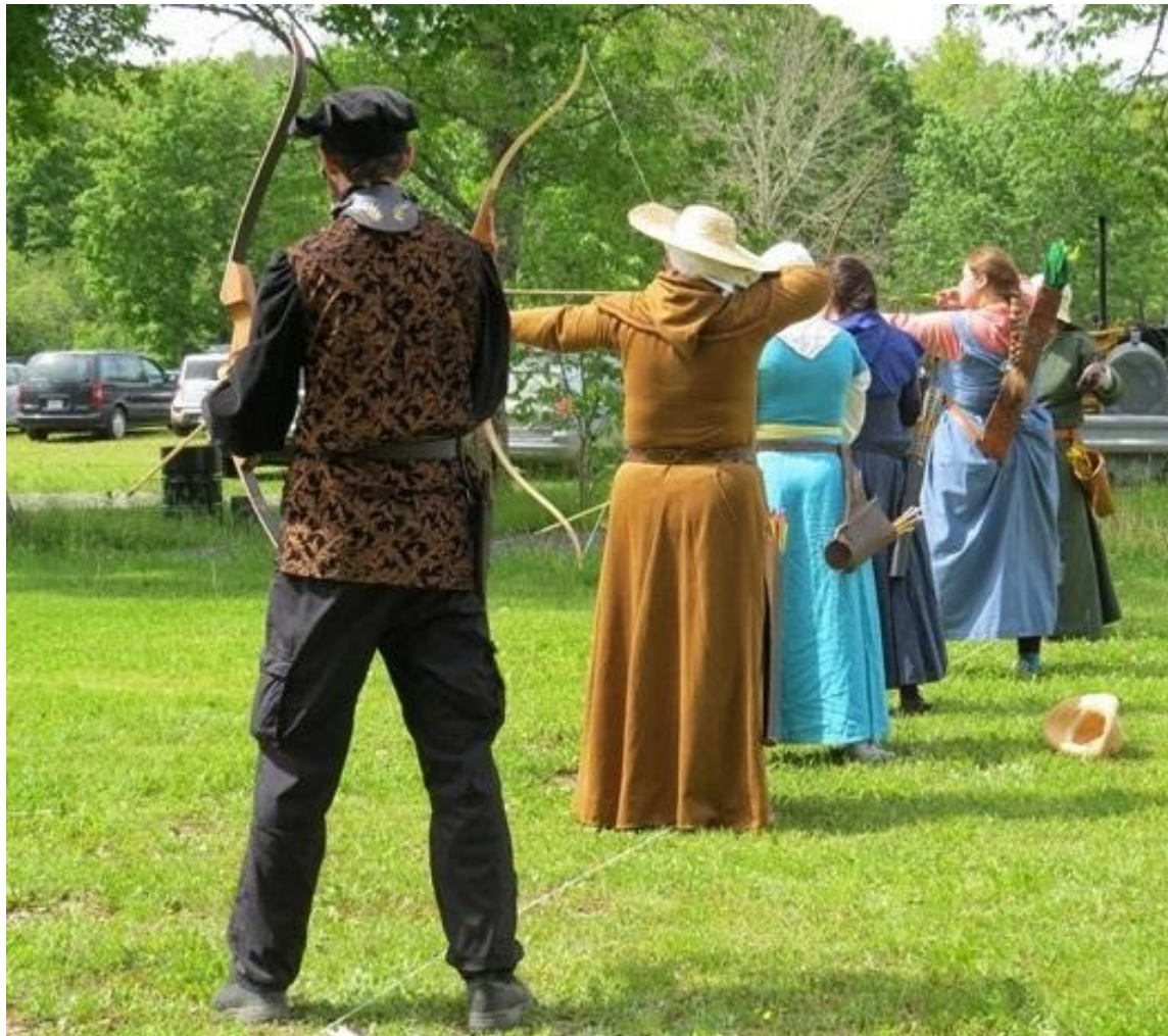
Ruantallan Archery Championship, War Camp, 2018