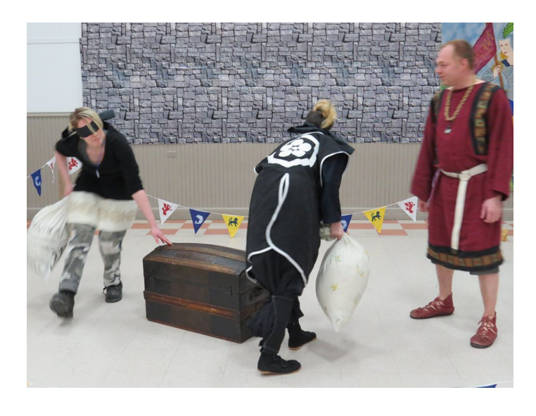
Medieval Box Fighting

The Quest of Atalanta and Hippomenes was a challenging quest with many subquests. The first subquest was Medieval Box Fighting.